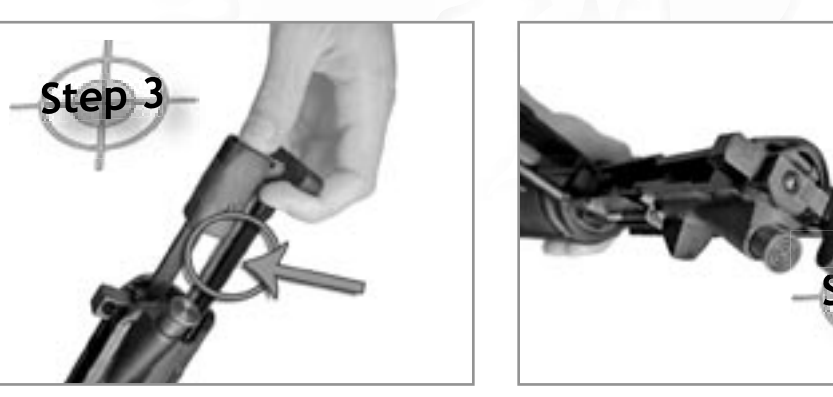
RFA Owner's Manual